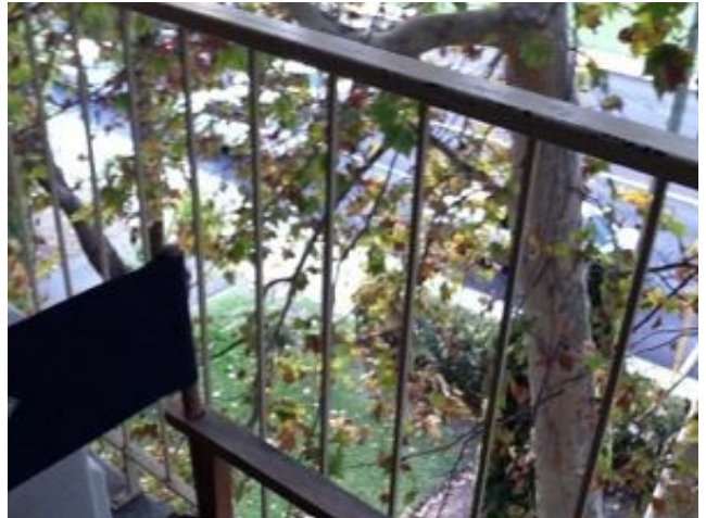
Front Gardens Taken : 22/01/2013 - 11:16