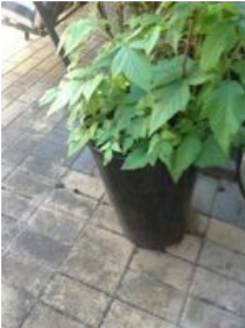
Front Gardens Taken : 22/01/2013 - 11:15