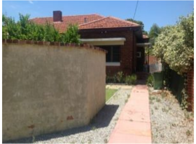
Front Gardens Taken : 22/01/2013 - 11:15