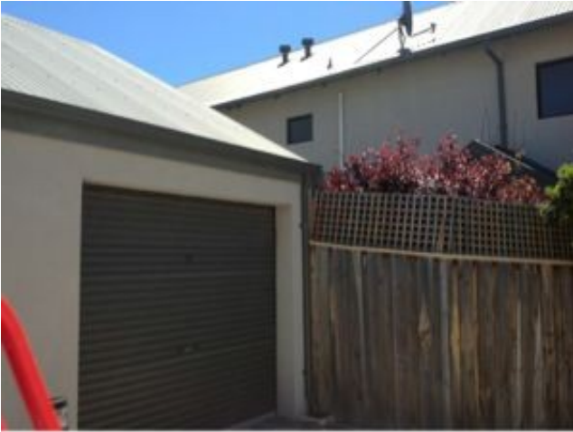
Front Gardens Taken : 22/11/2012 - 11:39