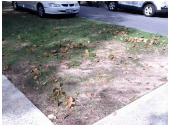
Exterior of Building Taken : 30/10/2012 - 19:02