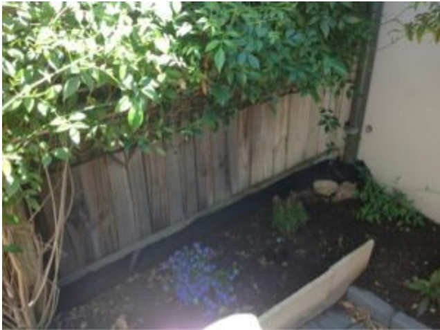
Front Gardens - Driveway Taken : 30/11/2012 - 11:38