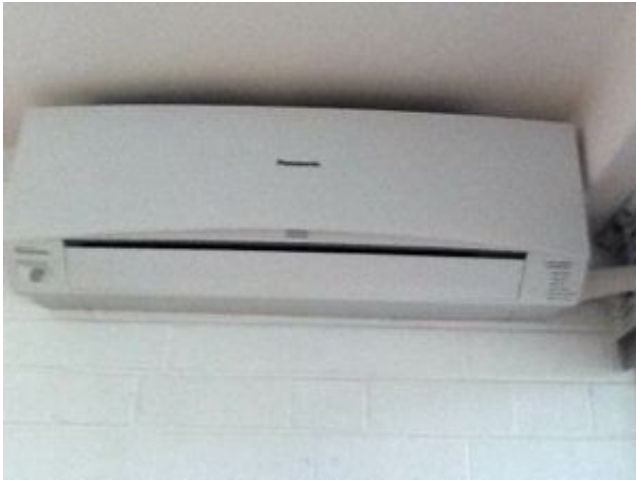
Bedroom 1 Taken : 06/09/2012 - 17:23