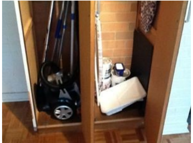
Bedroom 1 Taken : 21/11/2012 - 15:19