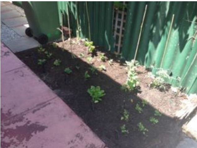
Front Gardens Taken : 22/01/2013 - 11:16